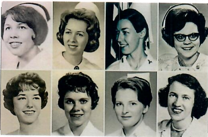
The American Military Women Who Lost Their Lives in Vietnam

"I want to say how proud I was of the women I served with, and how much we cared for these young men who served during that era," she continued. "I'm so grateful to all those wounded soldiers in particular who came to stand by our side and support us to help us get that memorial built. ... They were so appreciative and so grateful."